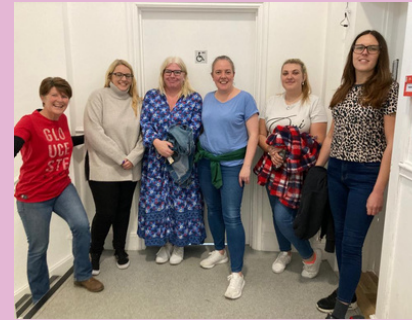
A team from Mears Group came in to help set up the winter shelter and do some sorting of donations.

During this week we also received news that we had been unsuccessful with a large three year grant from the Night Shelter Transformation Fund and it was noticed that we would need to move the Carol Concert to St Barnabas Church . But these test were overcome! Please come and join us there on the 1st December, it is going to be such a brilliant night again.