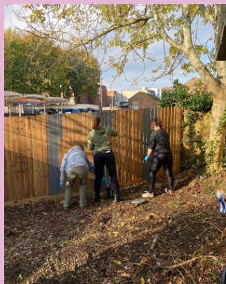
A team from Superdry spent the day finished transforming the end piece of wasteland in the garden. They levelled it, gravelled it and painted the fence.